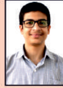
AMMAN ALAM 87.8%